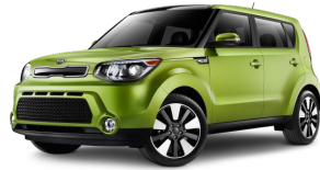
2015 Kia Soul

Always a large selection of new Kias in stock 10 year or 100,000 mile warranty $4,000 minimum trade in on "Red Tagged Vehicles"