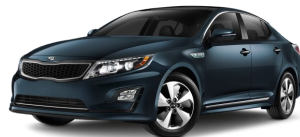
2015 Kia Optima Hybrid