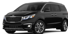
2015 Kia Sedona

501 SEVENTH STREET, PARKERSBURG, WV 26101