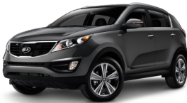
2015 Kia Sportage

Always a large selection of new Kias in stock 10 year or 100,000 mile warranty $4,000 minimum trade in on "Red Tagged Vehicles"