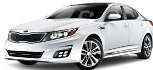
2015 Kia Optima