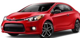
2015 Kia Forte Koup