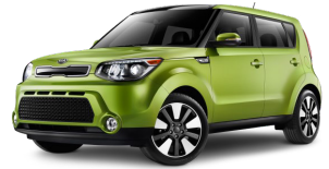
2015 Kia Soul

Always a large selection of new Kias in stock 10 year or 100,000 mile warranty $4,000 minimum trade in on "Red Tagged Vehicles"