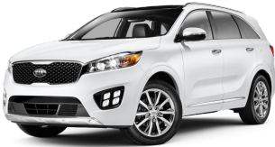
2016 Kia Sorento