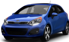
2015 Kia Rio5